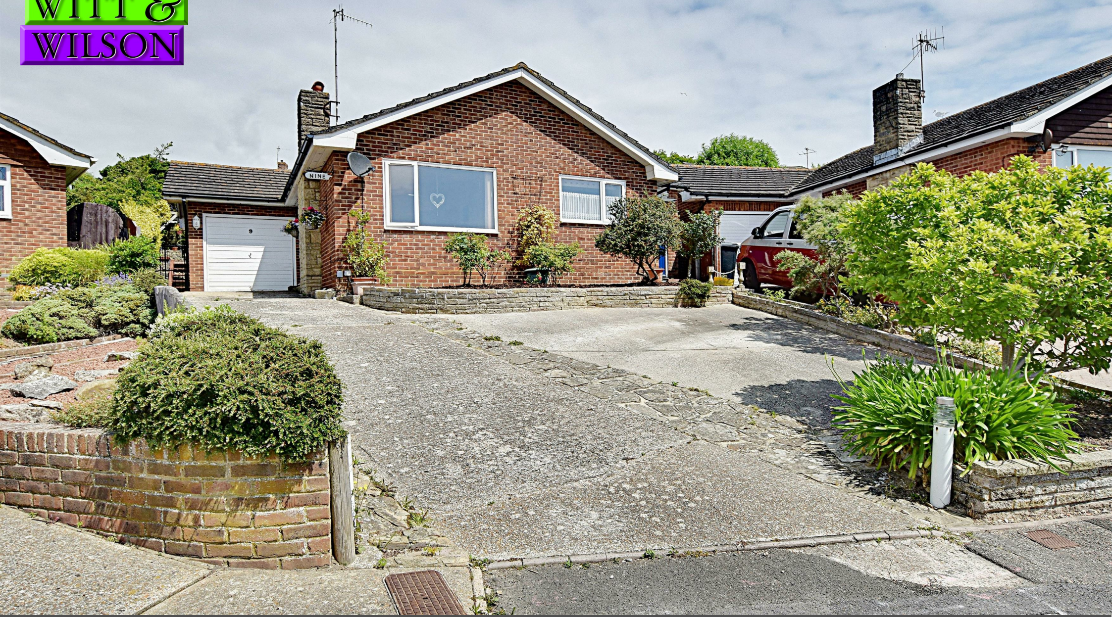
9 Silva Close, Bexhill-On-Sea, East Sussex TN40 2SY £325,000 Freehold